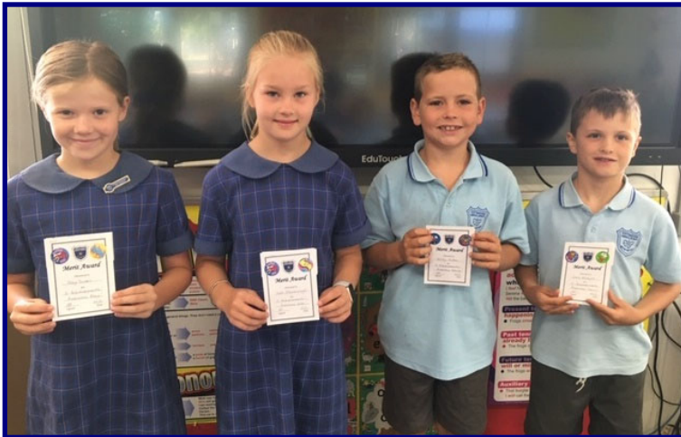
Congratulations to this week's PBL award recipients.