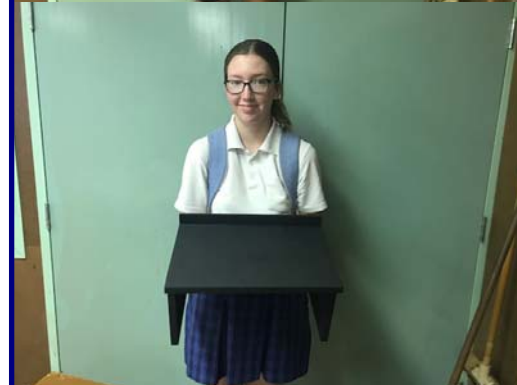
A couple of Design & Technology students (above) with their completed projects