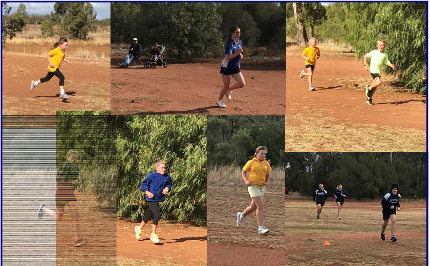
2018 cross country trials