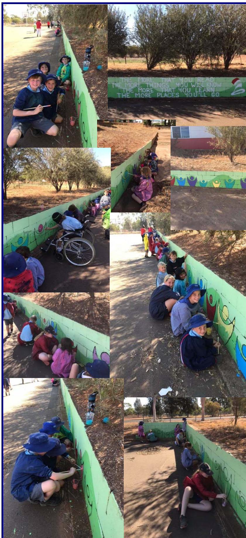
Primary students painted the mural on the brick wall at the old basketball courts. Looks great and very colourful!!