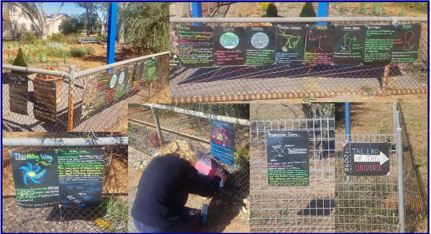
Secondary Assessment Schedule

Below are photos of Stage 5's scale model of the Universe on the school's front fence. Have a look next time you're here....very interesting!