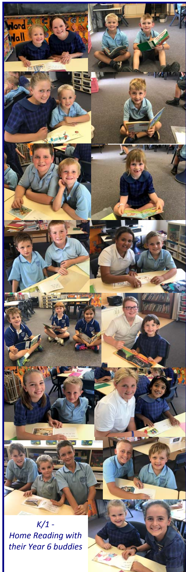
K/1 - Home Reading with their Year 6 buddies

All students in primary school will participate in Life Education sessions early next month. On the back of this page is the permission note, please return before Monday 5th March. Also included on the page is an order form for 'Harold' merchandise. Please make sure that correct money is sent in as the school does not process these orders.