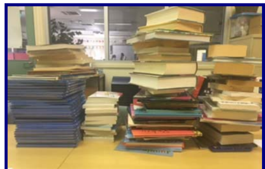
Some of the books donated to us for International Book Giving Day.