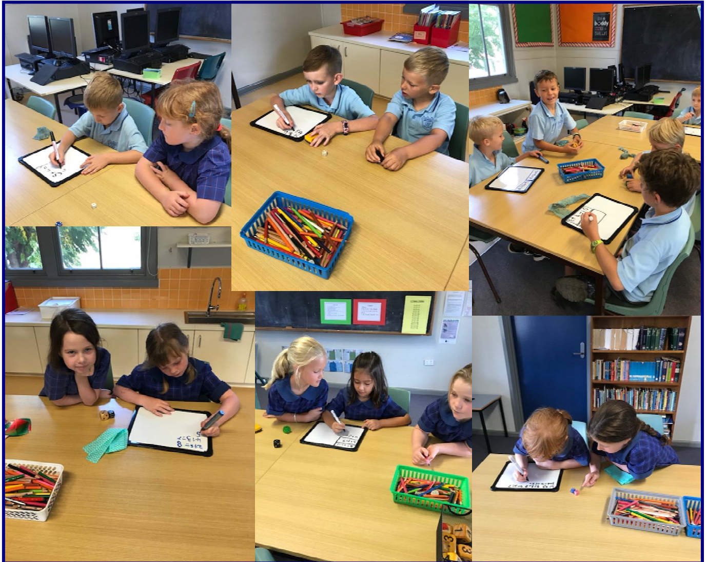
Year 1/2 Maths group, already hard at it, above