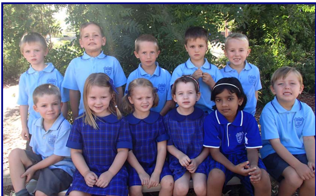
A big welcome to the 2018 kindergarten class, below