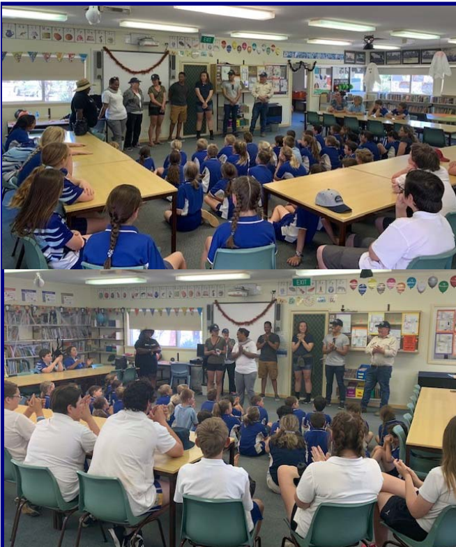
Last week we had a visit from students from Youth On A Mission who are touring around the district in conjunction with the Generocity Church. They spoke about their visits to farms in the district, the different countries they are from and the experiences they've had so far.