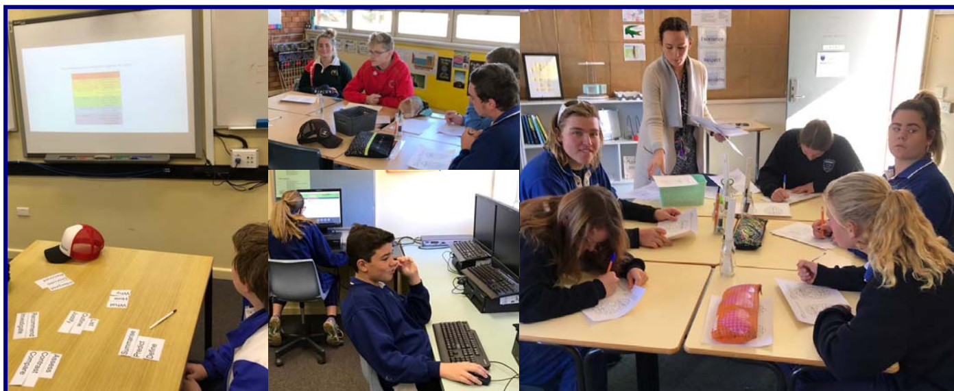
Below: Secondary students 'Learning to Learn'