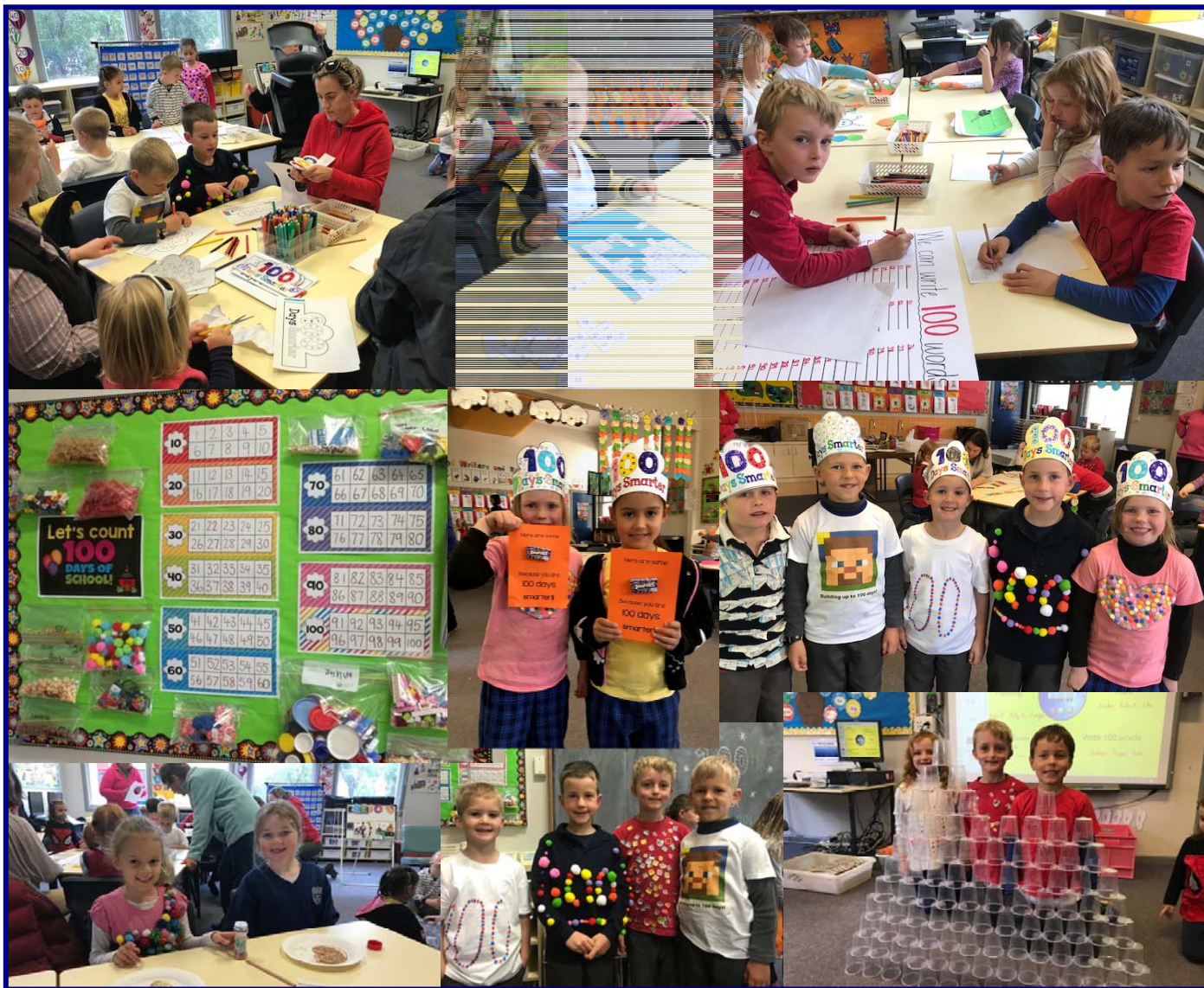
Above: K/1 enjoying their 100th day of school this year