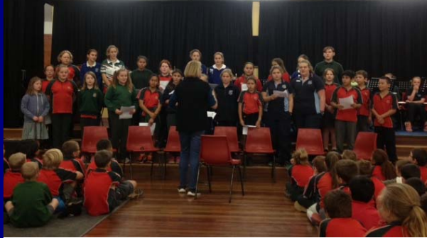
Photos from the Term 2 Combined Music day last Thursday