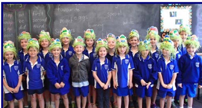
Below: Primary showing of their Easter hats