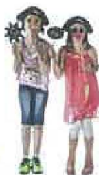
Photo Booth We will have our very own fun Photo Booth with lots of Props to capture great pictures with your family or friends!!!

Bring your picnic rug, chair, bean bag etc