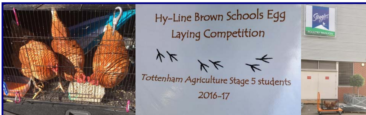
"Totty Chicks" at the Sydney Royal Easter Show

You are encouraged to use this space to give us any feedback on things which you feel you need to: congratulate a student, teacher or parent, let us know what you think of the newsletter format, make a suggestion or request.