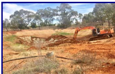
Dam cleaning and ag. Plot improvements