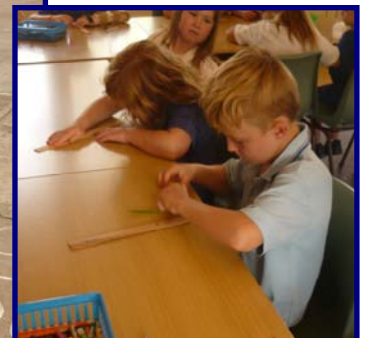
Year 1/2 Maths have been learning about measuring with metres and centimetres