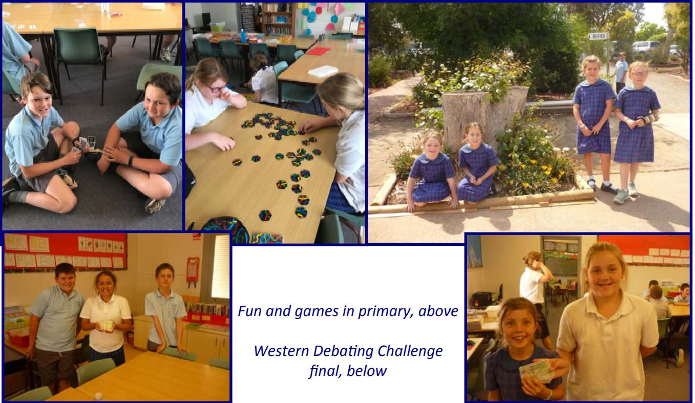
Fun and games in primary, above Western Debating Challenge final, below