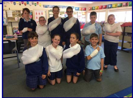
4/5/6 have been learning about First Aid in PD/Health/PE