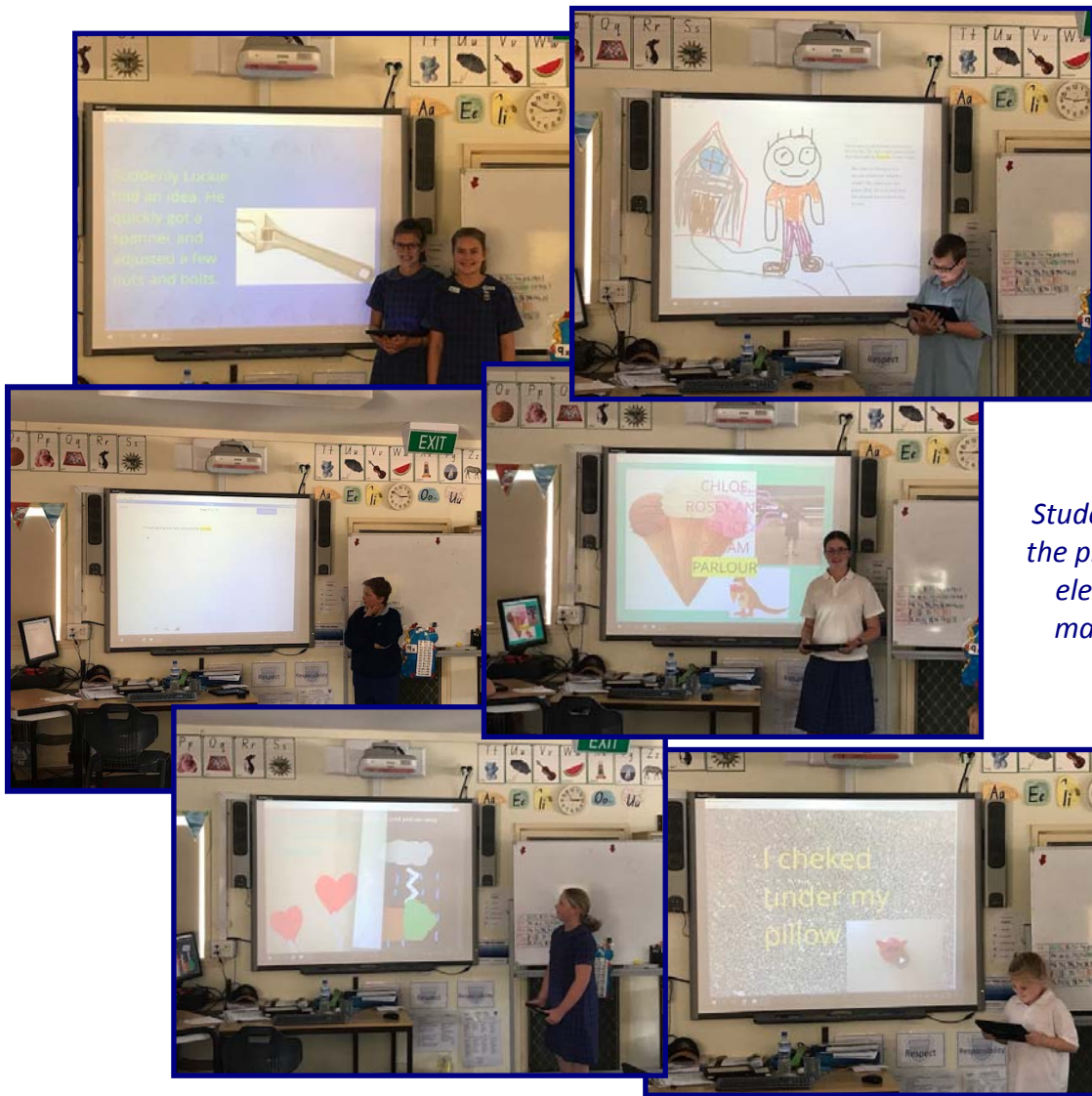
Students presenting the progress on their electronic books made in Interest Groups