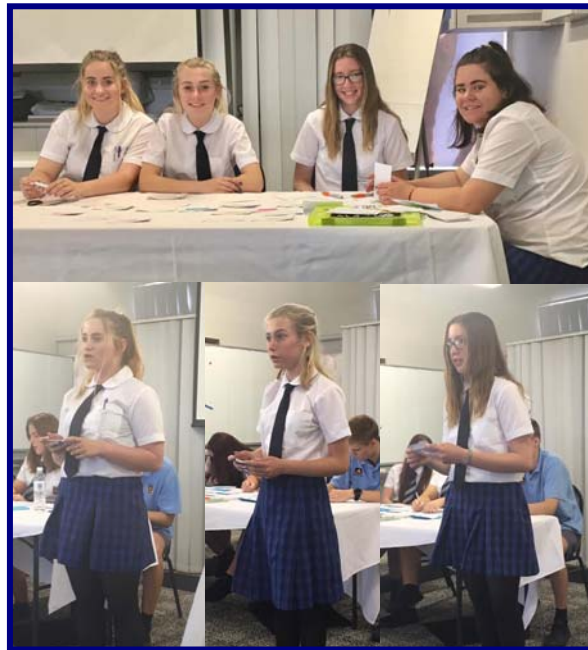
Secondary girls participating in the NAIDOC debate

Headphones are necessary to complete the test so students are welcome to bring their own to use, otherwise they can use the school sets.