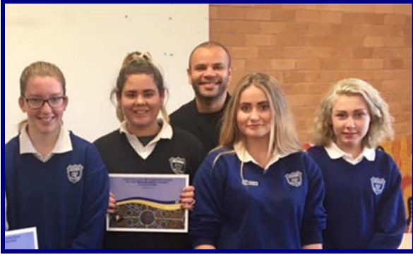
Our NAIDOC debating team at the 1st round at Dubbo West Primary School earlier in the year

On Monday next week, four of our secondary students will proudly represent our school at Taronga Western Plains Zoo for the 2017 NAIDOC Public Speaking and Debating Challenge State Finals against Lithgow High School, Ulladulla High School, Wagga Wagga High School, Bulli High School and Hay War Memorial High School.