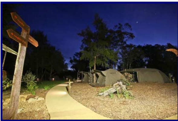
Billabong Camp at Taronga Western Plains Zoo we're we'll get to meet debating students from other schools and camp together on Sunday night

As part of the privilege of making it to the State Finals, the girls and myself will enjoy a complimentary afternoon of activities at the Zoo on Sunday afternoon, as well as dinner, supper and a ZoosnooZ experience at Billabong Camp on Sunday night. We then have a breakfast on Monday morning at the Zoo before the official debating program begins at 9am.