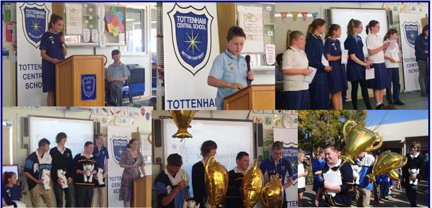
Year 12 Farewell assembly