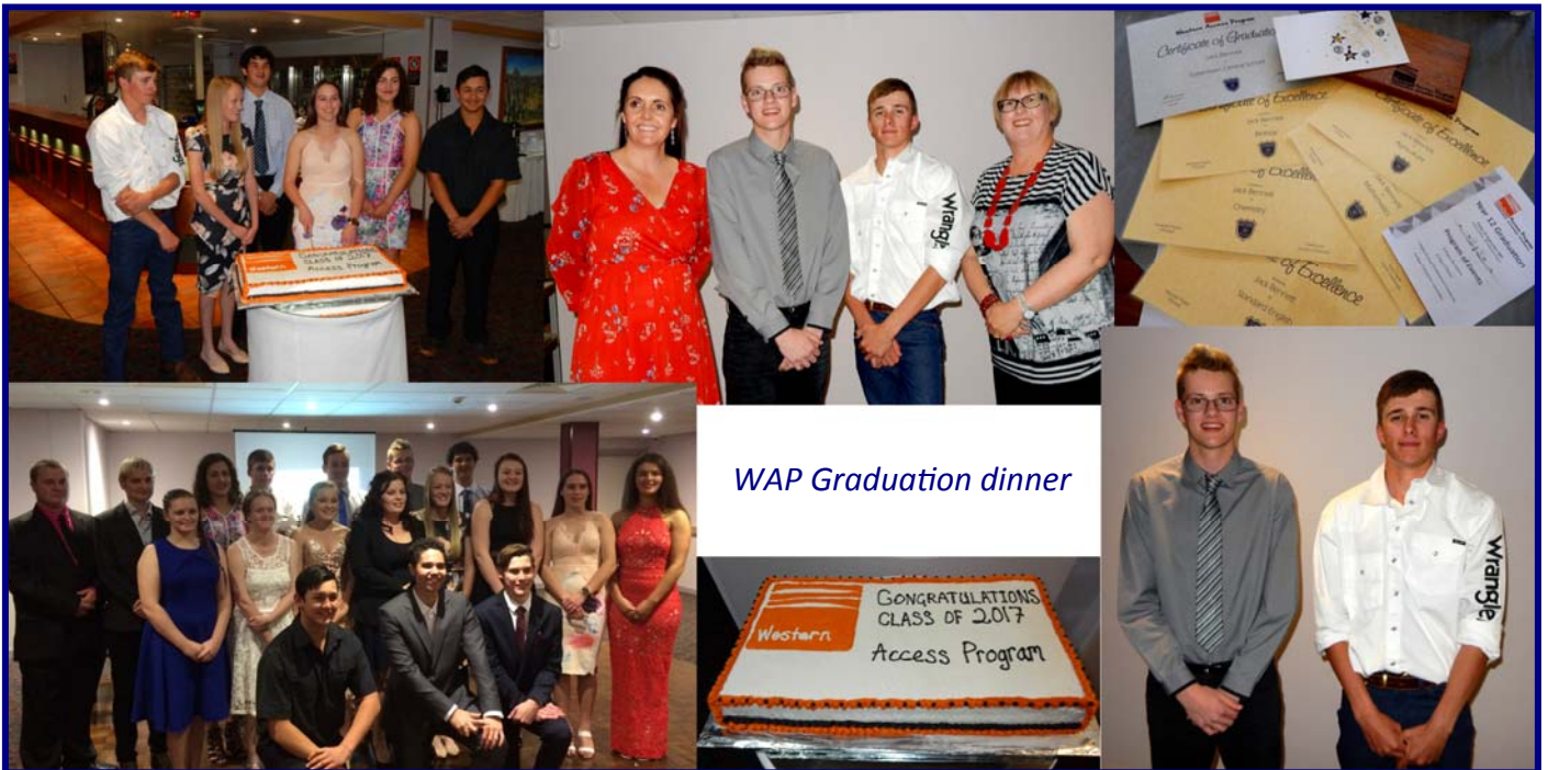
WAP Graduation dinner