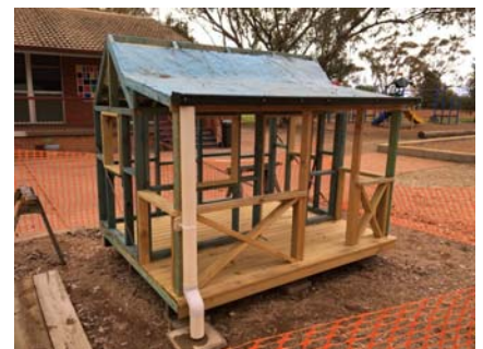
Cubby house under construction !