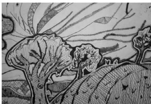
Image: Cudgegong Valley Public School, Detail from Cudjee Landscape 2016, ink on paper