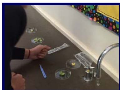
Students examining the difference between monocot and dicot seed structures and starch content.

In Agriculture, students study the science behind agricultural production. In the Preliminary course students are given an introduction into plant and animal science and apply knowledge to a Farm Case Study. In the HSC course this is further expanded and students apply their knowledge of experimental design to complete a plant density trial using statistics to then analyse their data. We will also be focusing on the challenge of climate change in farming. Below are some photos of our students in the lab at their plant practical day where they were learning about plant anatomy and functions of specific cells.